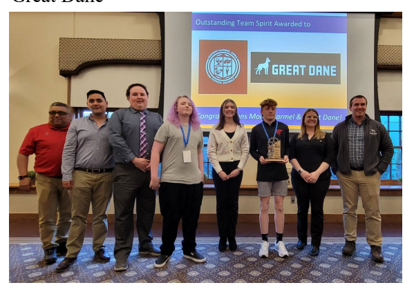
Outstanding Team Spirit Mount Carmel Area Middle School Great Dane